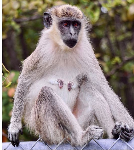
Phoebe in deep thought.