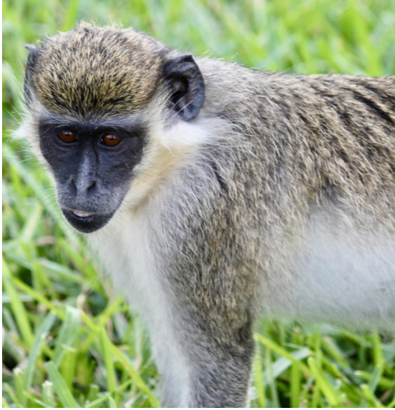
Jane out for a cruise!